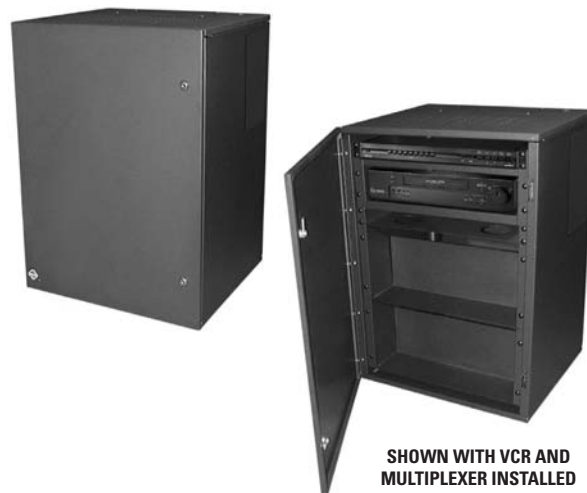
SHOWN WITH VCR AND MULTIPLEXER INSTALLED

The LB3000 Series lock box provides a secure housing for a VCR, multiplexer, manuals, and up to 32 VCR tapes. Two keyed locks on the front door prevent unauthorized entry.